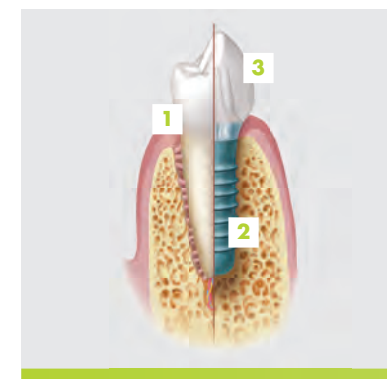
Natural tooth (1), dental implant (2), tooth crown (3)

A dental implant is a small part made of titanium or titanium zirconium which is placed in the jaw bone in place of the missing natural tooth root. The implant can be surgically inserted under local anesthetic on an outpatient basis. Titanium is generally well-tolerated by the human body and bone has been shown to bond well to titanium. Once healed, the artificial root acts as a base for fixing individual crowns and multi-tooth bridges. The implant can also be used as an anchor for entire dental prostheses.